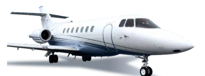
JETS &amp; YACHTS