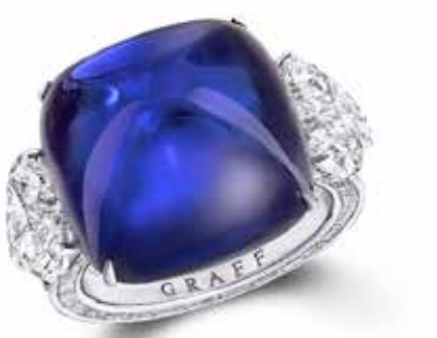
FASHION &amp; JEWELLERY