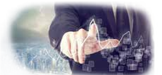
FINANCE &amp; MARKETS