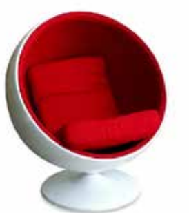
HOME &amp; STYLE