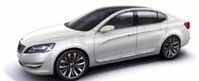
SPORTS &amp; LUXURY CARS