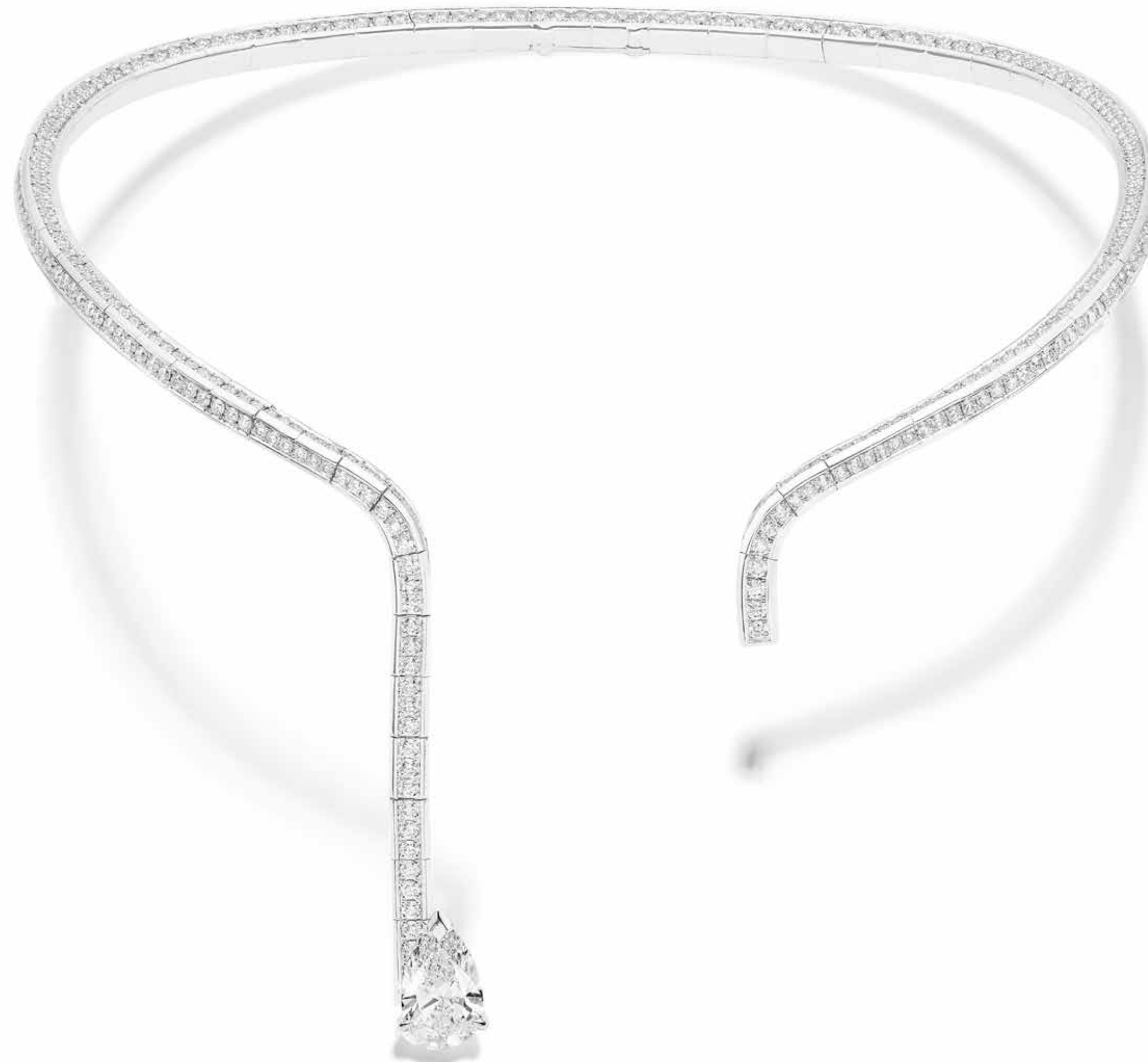
La Ligne Necklace in 18K white gold set with one 2.84-carat pear-shaped diamond and 392 diamonds; La Ligne Collection. POA.

If I had to sum up La Ligne , I would say that it is an homage to REPOSSI lignée (family tradition) by means of minimalism that takes your breath away.