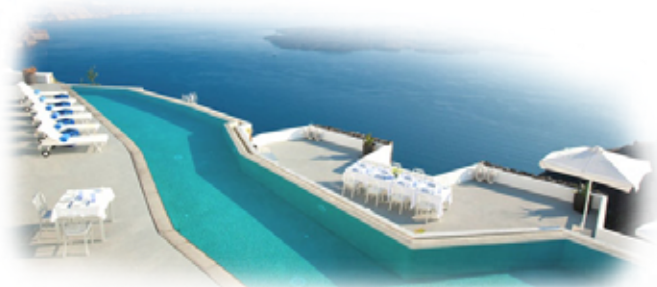
LIFESTYLE &amp; TRAVEL